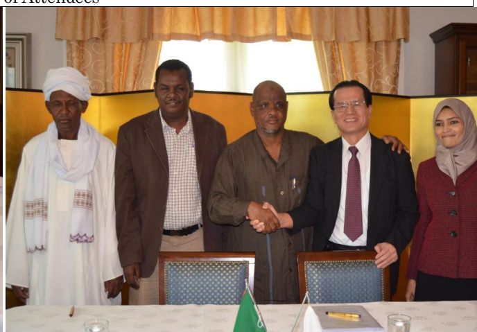
Ambassador with Prof Al-Sheikh Al-Faki, Minister of Education in White Nile State and other stakeholders