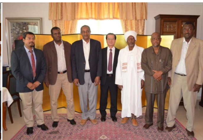
Group Photos of Attendees